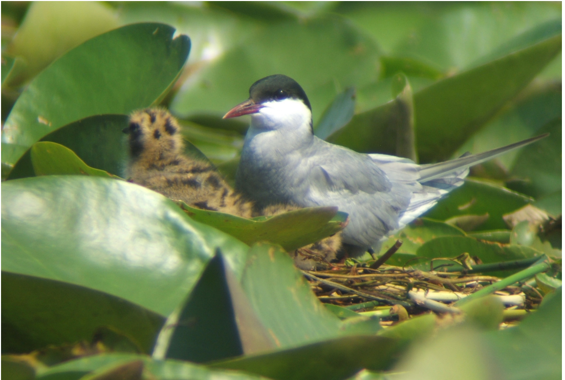
Figure 1. Whiskered tern with chicks on nest within White Waterlily beds in Lake Grand-Lieu, France.

back. As hatching is synchronous within a clutch (Cramp 1985, pers. obs.), we suppose that hatching dates were correctly assigned for all chicks ( n = 33 ). The day of hatching was denoted as day 0, and the average value of chick age at first encounter was 1.2 \text{ days} \pm 0.2 \text{ SE} (range: 0–3 days, n = 33 chicks). Within the enclosures, at first encounter all chicks were marked with a paint mark on their heads, and then ringed within 4.9 \text{ days} \pm 0.3 \text{ SE} (range: 2–8 days, n = 33 chicks) from hatching with a metal ring provided by the CRBPO. Each chick was weighed to the nearest 0.1 g using an electronic balance. The tarsus and culmen (from the tip of the bill to the base of the feathers) lengths were measured with a Vernier calliper to the nearest 0.1 mm, and the wing length (from the carpal joint to the top of the wing) was measured to the nearest 1 mm using a